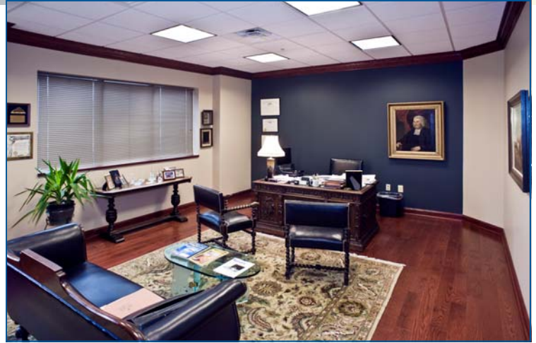
Custom Office Finishes